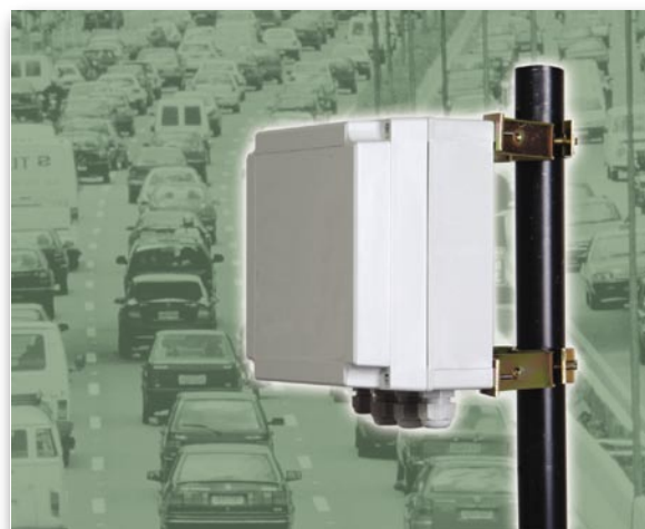
All Weather Applications